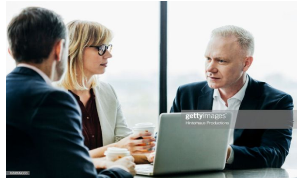
Canvassing Public Representatives