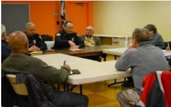
Attend Local & Joint Policing Forums