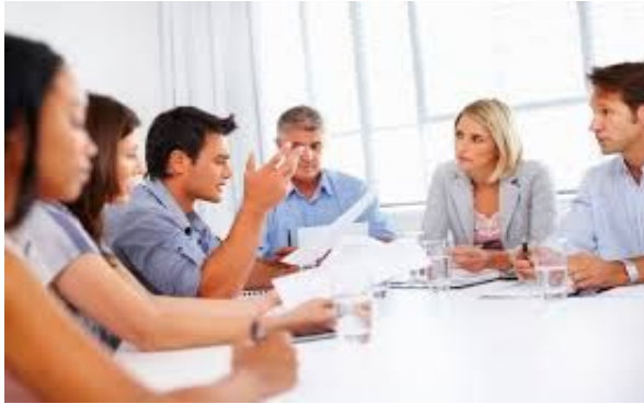
County Council Deputations