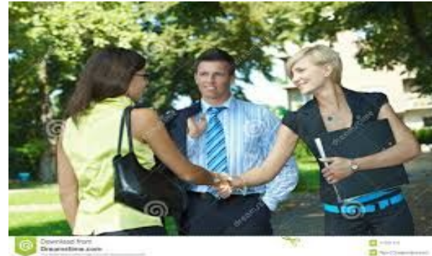
On site meetings with Council & Others